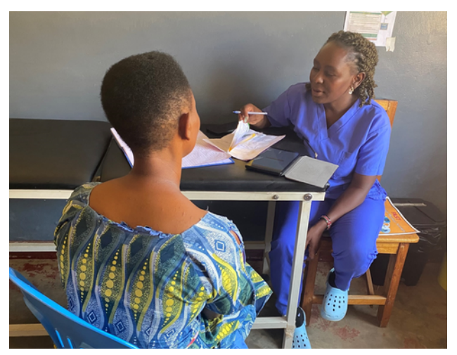
Pictured: BACKTRACK in Action March 2023

The research team have developed a clinical decision support system called BACKTRACK for clinical officers and nurses working in rural health centres in Uganda. The BACKTRACK app facilitates the assessment of patients with low back pain through a series of precise questions which enables the clinician to safely identify low back pain cases that are amenable to self-management and assists the clinician in dispatching evidence-based self-management advice and identification of those cases that should be referred onwards for specialist assessment and interventions. Since January, BACKTRACK has been implemented into routine practice in 10 rural health centres in the Mbarara district of Uganda. The UCD BACKTRACK team has travelled three times to Uganda in the last 12 months to engage with stakeholders, to co-design BACKTRACK with end users and to evaluate the impact of BACKTRACK on patients and care pathways.